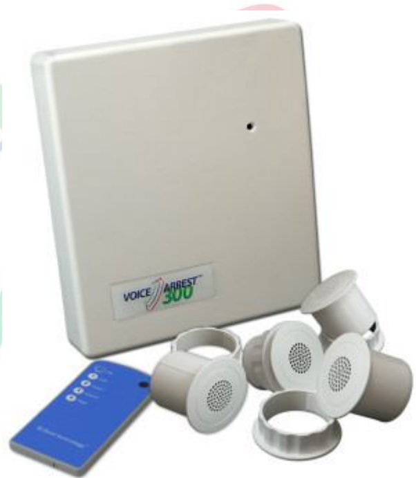
Controlled Assess, Ceiling Tile-Based System, Providing State-of-the-Art Direct-Field Speech Privacy Technology

But accepted standards from ISO, ANSI, and ASTM already define "Oral Privacy" in a manner that can be quantitatively measured. They also describe available methods for monitoring private environments where Oral Privacy is required but walls are impractical. These standards already meet the "reasonableness" test and provide "best practices" to follow. And they enable providers to go about